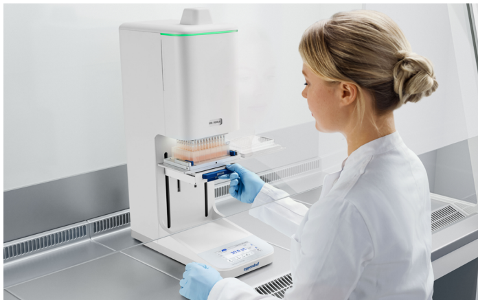
Figure 2: Using the epMotion 96 Flex in a biosafety cabinet. All interaction elements can be easily reached. Convenient and safe operation due to the touch screen located at the device base and automatic tip loading/ejection procedures.

Working in the limited workspace of a biosafety cabinet for extended periods can be physically demanding. Researchers need to maintain proper posture and hand positioning to minimize the risk of fatigue or discomfort. The design of the epMotion 96 Flex makes it ideal for the usage in a biosafety cabinet. The footprint of the device is small enough to be placed inside the cabinet without taking up too much space that is needed for other items like pipette tips, media containers, and plates. The main interaction elements of the epMotion 96 Flex are the touch display located at the device base and the work-table hosting plates, tips, and reagent reservoirs (Fig. 2).