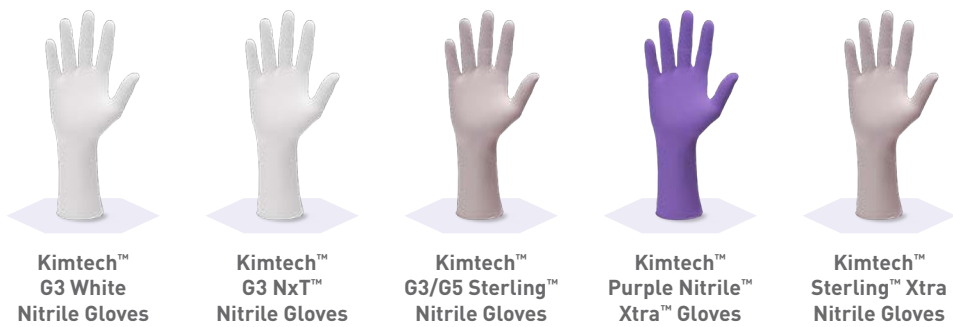
Kimtech™ G3 White Nitrile Gloves