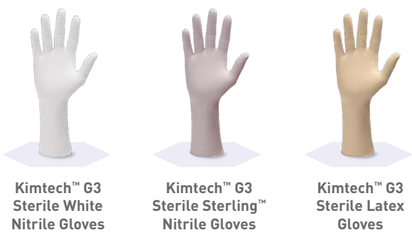
Kimtech™ G3 Sterile White Nitrile Gloves