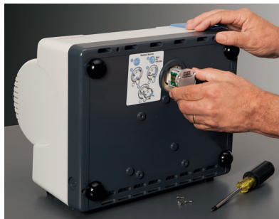
Easy, user-accessible source replacement

* KBr optics, 4 \text{cm}^{-1} spectral resolution