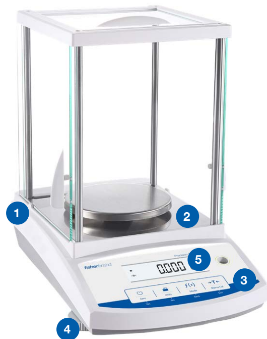
Image above is representative of a precision balance with draft shield**