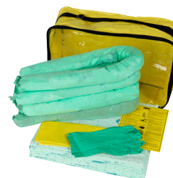
Large spill kit