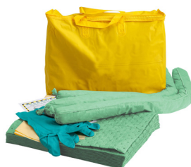
Small spill kit